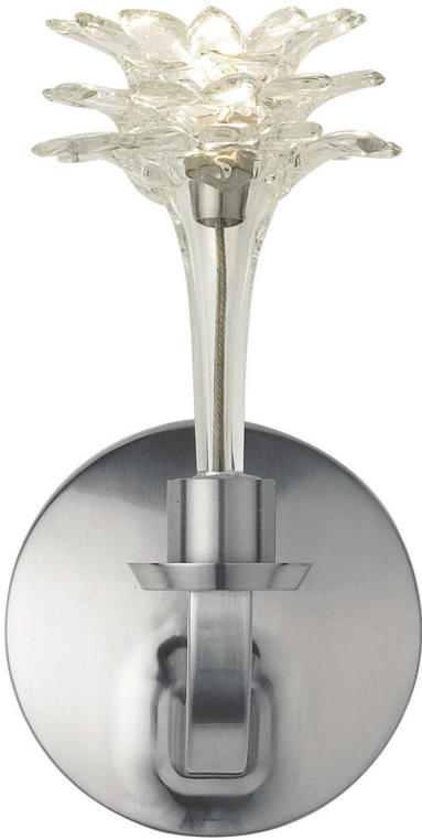
Shown with Clear Shade with Satin Nickel Hardware