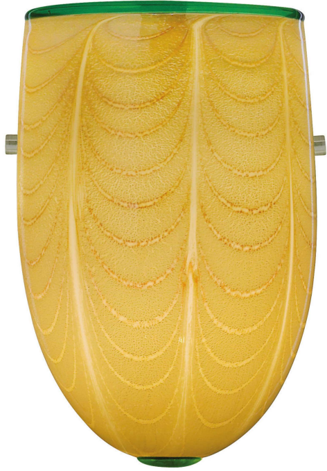
Shown with Ivory Shade with Satin Nickel Hardware