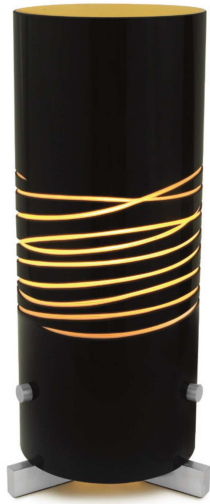
Dune Due shown with Black/Sand Shade with Satin Nickel Hardware