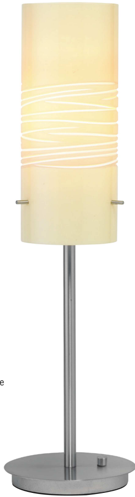
Dune shown with Sand Shade with Satin Nickel Hardware